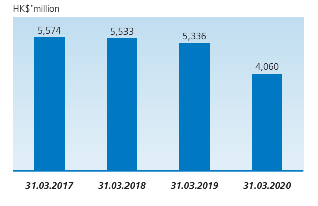
Net (Loss) Profit